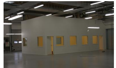
The new trainingcenter in DAMRC Technology Center